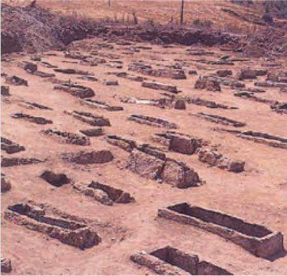
Agia Paraskevi Cemetery