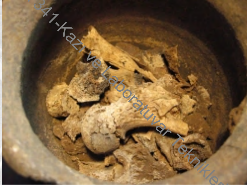
Cremated bone in Roman urn