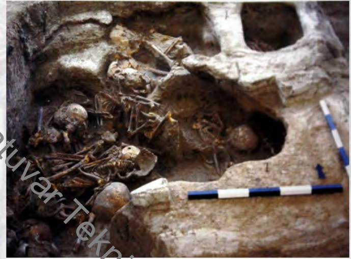
Çatalhöyük yapı tabanının altındaki gömütler