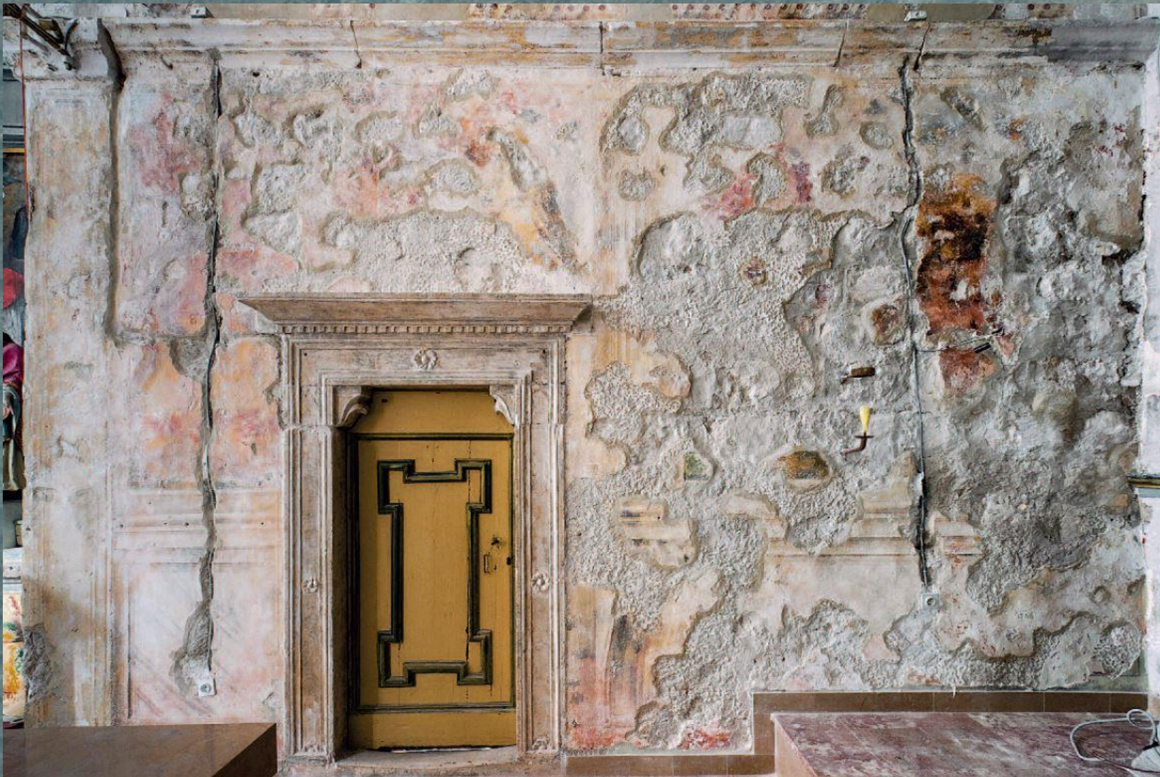
Mortar additions along the borders of historic plaster, Church of St. Vitus, Modestus and Crescentia, Trsteno (Croatia), 16/17th century; Photo: 2010, HRZ (Katarina Gavrilica); Weyer, E. (ed.), (2015), EwaGlos:European Illustrated Glossary Of Conservation Terms For Wall Paintings And Architectural Surfaces, Petersberg: Hornemann Institute; 322.