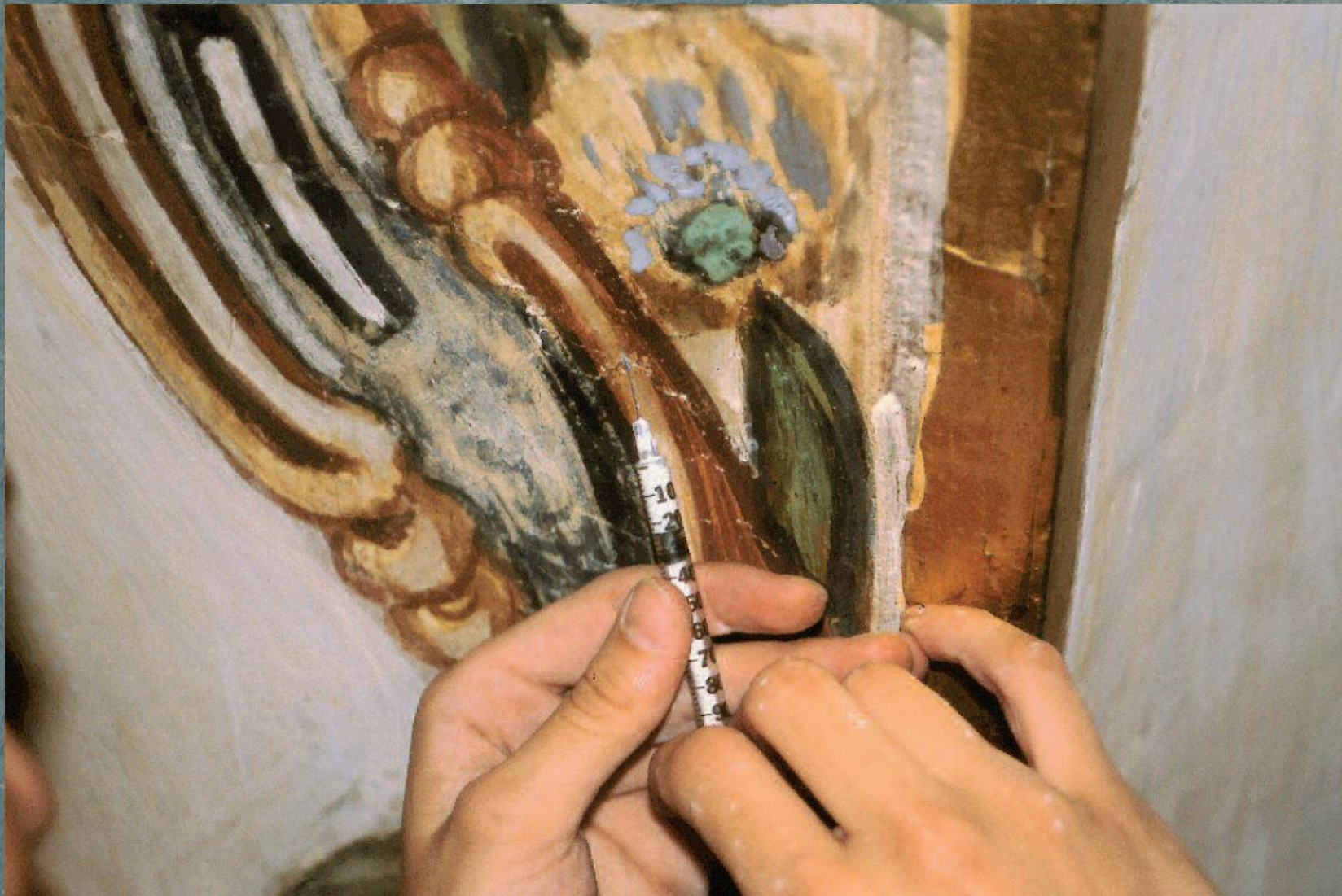
Injection of an adhesive into a wall painting, Church of San Roque, Oliva (Spain), 20th century; Photo: 2009, UPV; Weyer, E. (ed.), (2015), EwaGlos:European Illustrated Glossary Of Conservation Terms For Wall Paintings And Architectural Surfaces , Petersberg: Hornemann Institute; 314.