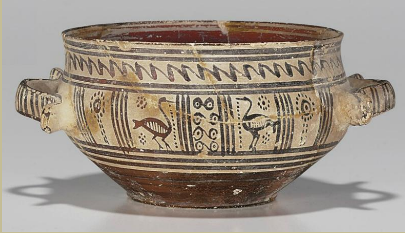
Geç Geometrik Dönem, M.Ö. c. 760-735