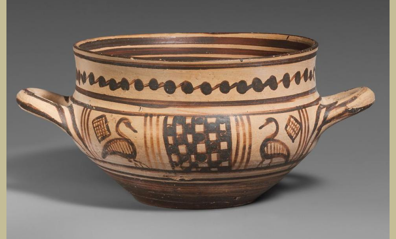
M.Ö. c. 750