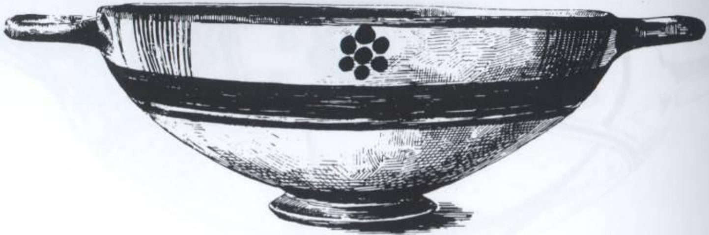
Figure 6.2 Rosette bowl: lost (from Vroulia). Ht 9 cm. Early 6th century.