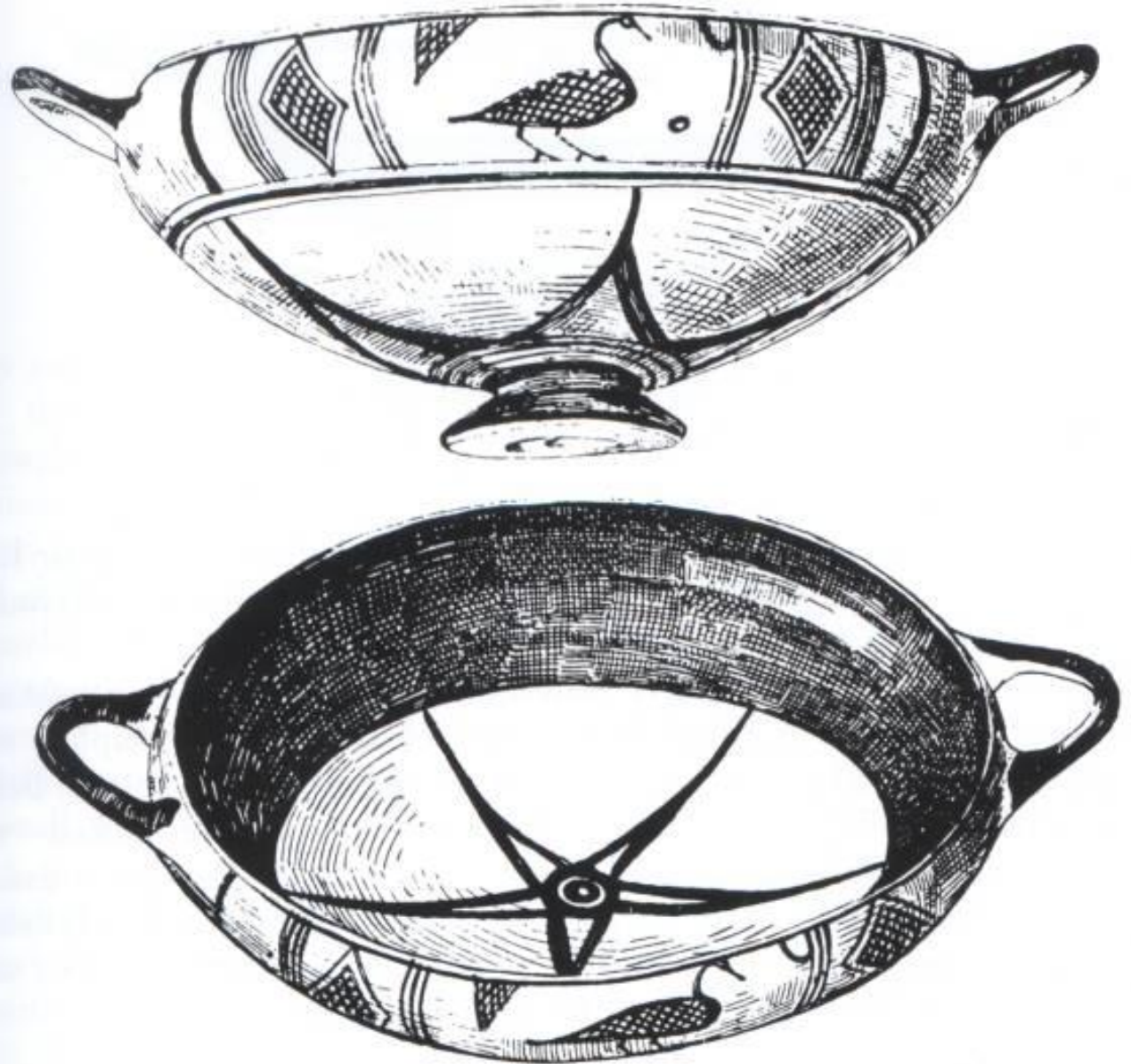
Figure 6.1 Bird bowl: Copenhagen ABc 899. Ht 5.5 cm. Mid 7th century.