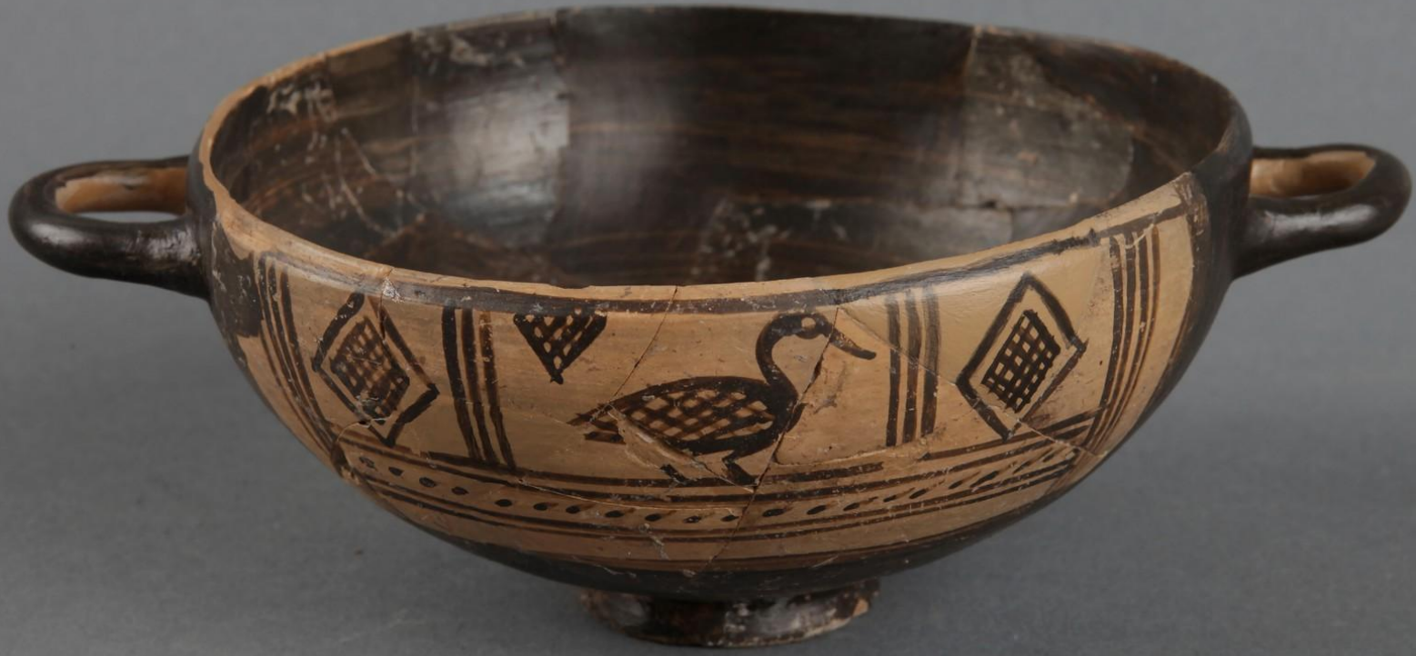
Kuşlu Kase, M.Ö. 7.yy, h. 6cm, a.ç. 12.5 cm.