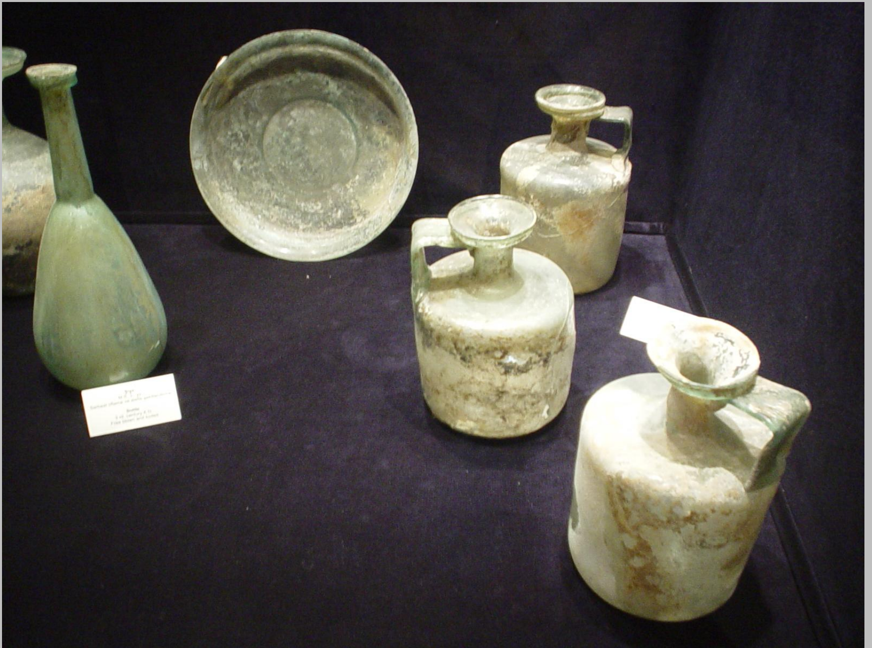
77 H. 2. 1. 1. Lithuanian Museum of Natural History Bottle 2 1/2 in. high x 1 1/2 in. 1888. Found at the site.