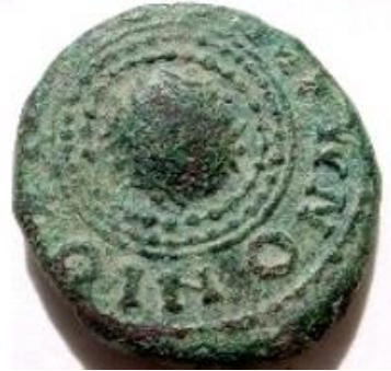
Makedonia (İ.S. 81 - 96) Ö/ "ΑΥΤ ΚΑΙΣΑΡ ΔΟΜΙΤΑΙΝΟΣ ΣΕΒ" Α / "ΚΟΙΝΟΝ - ΜΑΚΕΔΟΝΩΝ"