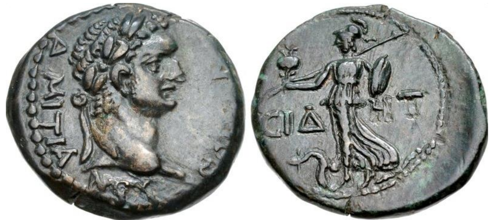
Side – Pamphylia İ.S. 81 - 96