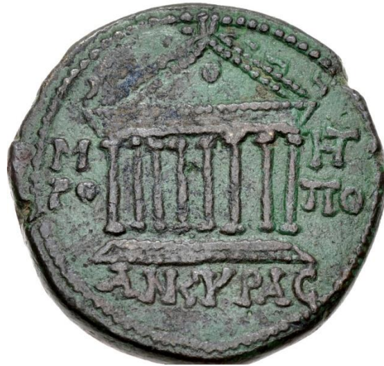
Ankyra –Galatia İ.S. 198 - 217