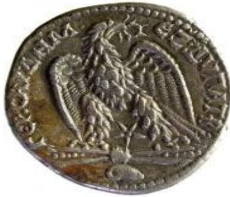
Antiocheia ad orontem - Syria (İ.S. 177 - 180) Ö/ "ΑΥΤ ΚΑΙΣ ΚΟΜΜΟΔΟΣ ΣΕΒ" Α / "ΓΕΡ ΣΑΡ ΔΗΜ ΕΕ Δ ΥΠΑΤ Β"