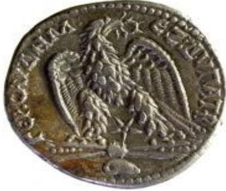
Antiochia ad Orontem - Syria (İ.S. 177 - 180) Ö / "ΑΥΤ ΚΑΙΣ ΚΟΜΜΟΔΟΣ ΣΕΒ" Α / "ΤΕΡ ΣΑΡ ΔΗΜ ΕΞ Δ ΥΠΙΑΤ Β"