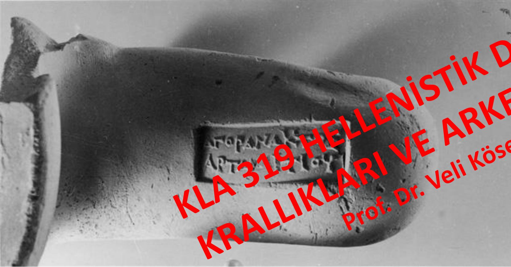
figure 5. Stamp on the other handle of the same amphora, giving the fabricant, Agoranax, and the month, Artamitios.