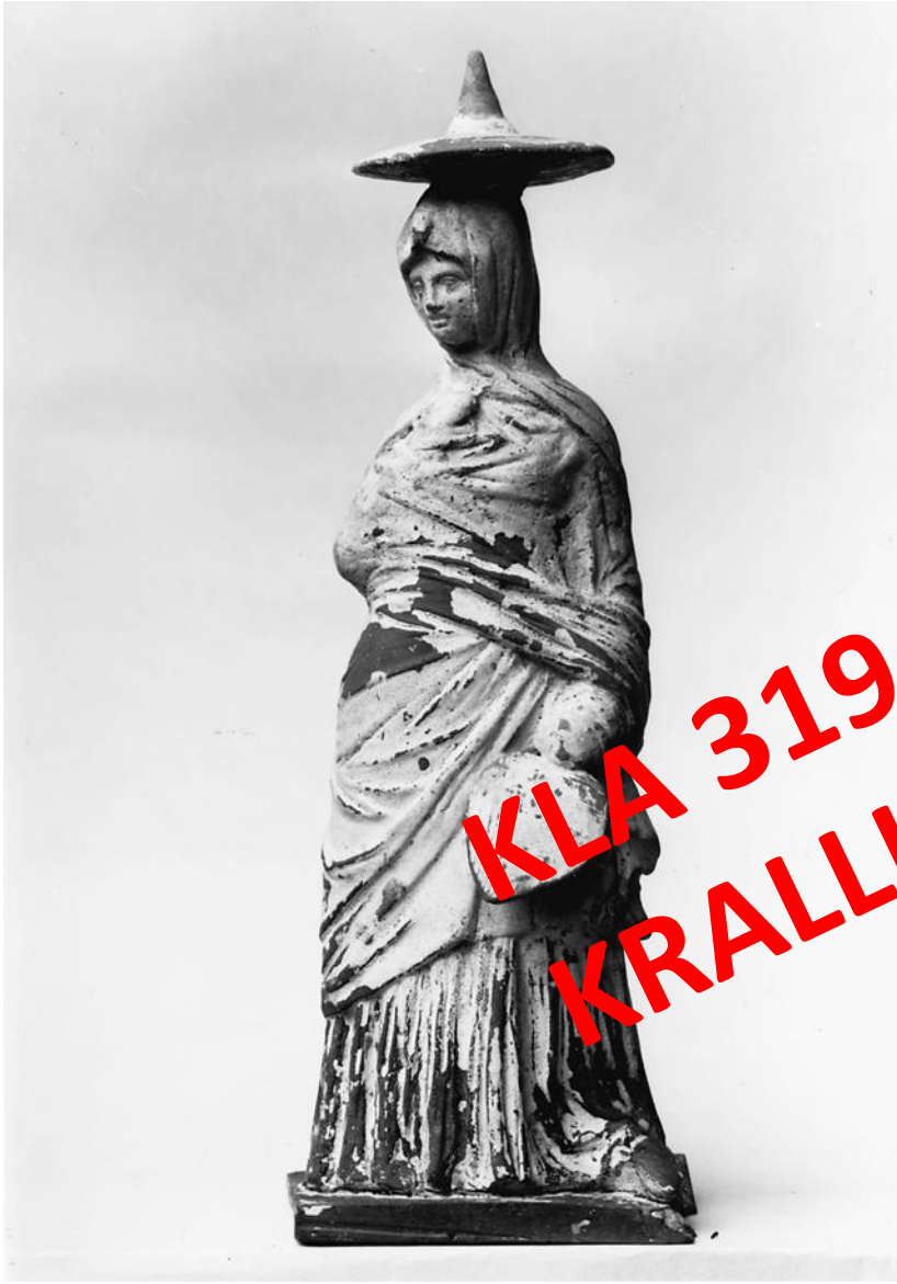
figure 11. Terracotta figurine from Tanagra: draped woman wearing a sun hat and holding a fan (British Museum C245;).