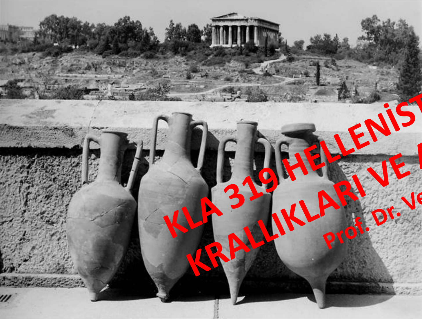
figure 3 Amphoras from Rhodes, Knidos, Chios, and Italy destroyed in the Sulla sack of Athens in 86 b.c. (Athens Agora Excavations, SS 8602, SS 7918, P 19120, and SS 7319;)