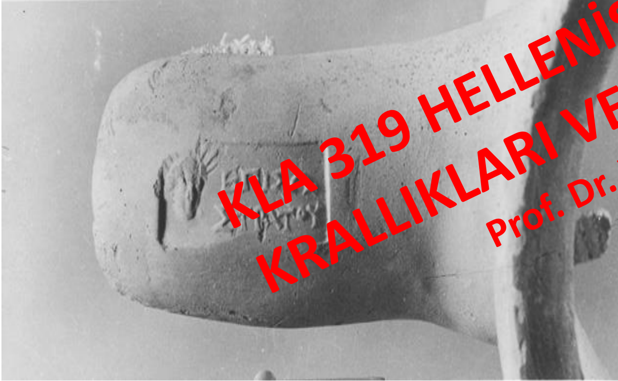
Figure 4. Stamp on a Rhodian handle, with the head of Helios and the name of the pottym, Sostratos (Athens, Agora Excavations, SS 7584).