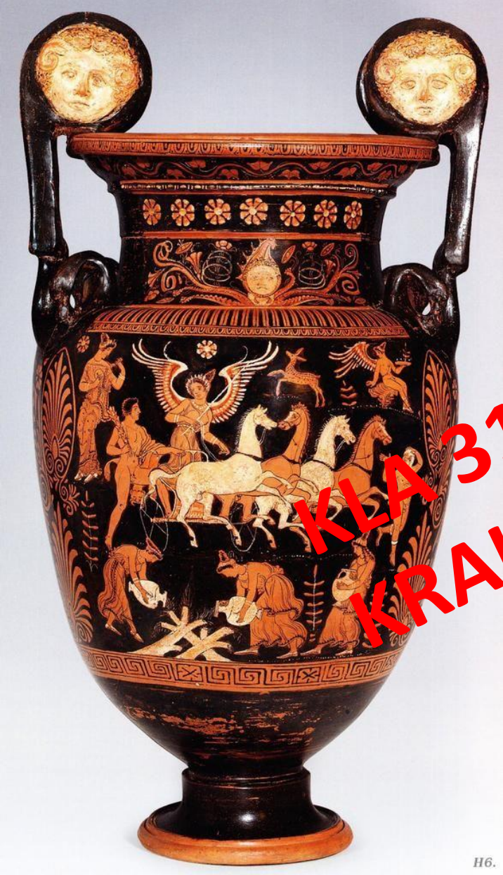
Apulian Crater, 4. century BC