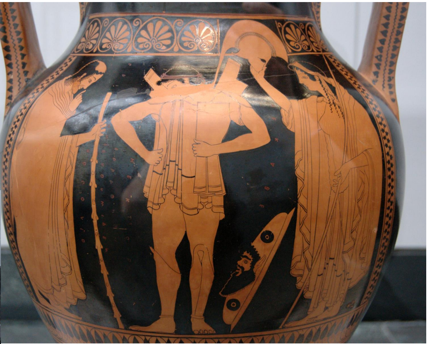
Hector putting his armor on, surrounded by Priam and Hecuba. Side A of an Attic red-figure amphora, ca. 510 BC. From Vulci.