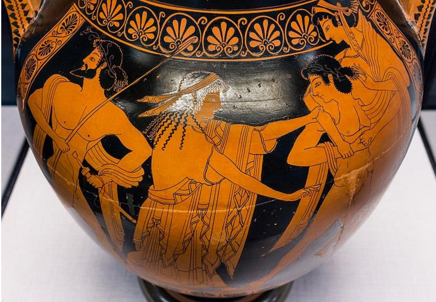
description side A: Peirithoos, the friend of Theseus, looking back; Korone, a friend of Helena, trying to help Helena; Theseus carrying off Helena; the name inscriptions of Korone and Helena are interchanged, either unintentionally, or as a humorous allusion to an Athenian hetaira - side B: Helenas father Priamos and two running women (Helena's friends or sisters?) - production place: Athens - painter: Euthymides - period / date: late archaic, ca. 510 BC - material: pottery (clay) - height: 57,5 cm - findspot: Vulci - museum / inventory number: München, Staatliche Antikensammlungen 2309 - bibliography: John D. Beazley, Attic Red-Figure Vase-Painters , Oxford 1963(2), 27, 4