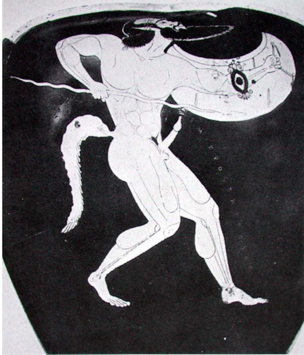
Smikros, Boyunlu Amfora, Satyr