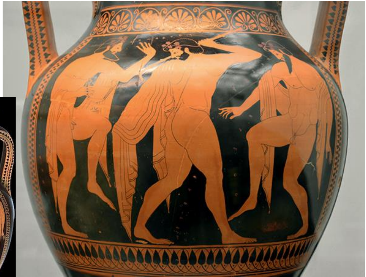
Euthymides, Üç Eğlence Düşkünü (Atina tarzı kırmızı-figür amfora), yaklaşık 510 B.C.E., 24 inches high (Staatliche Antikensammlungen, Munich)