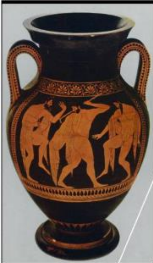
Red-figure amphora, c. 510-500, Euthymides