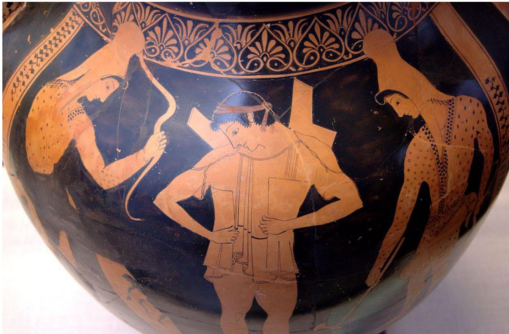
Hector putting his armor on, side A of a red-figure paunch amphora, 510–500 BC, Staatliche Antikensammlungen (Inv. 2308), Munich.