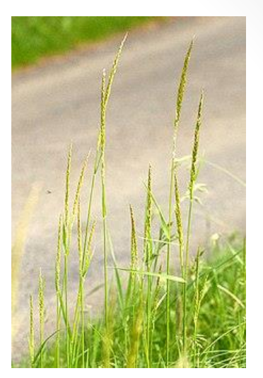
Trisetum flavescens, sarı yulaf