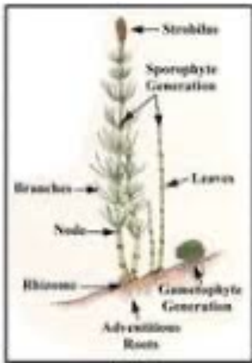
Habit of Equisetum