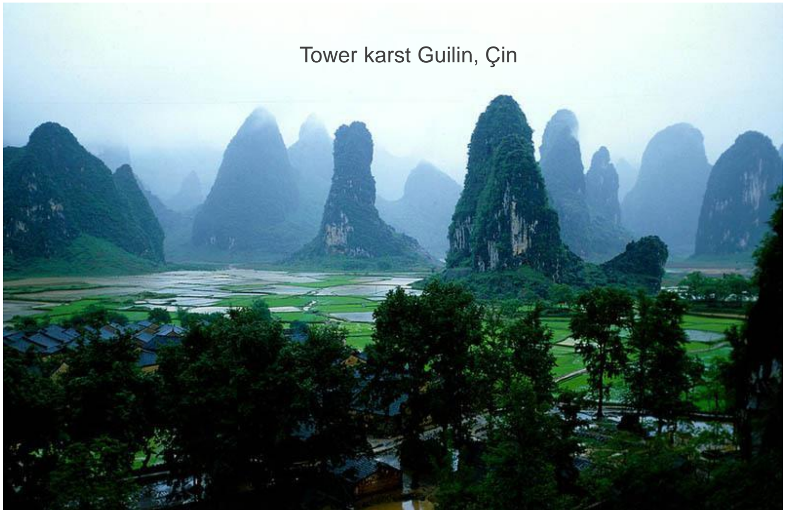
Tower karst Guilin, Çin

In tower karst (known as Turmkarst in German), the remaining hills take the form of towers or mogotes (also referred to as haystack hills), which rise 100 meters or more, featuring exceedingly steep to overhanging lower slopes.