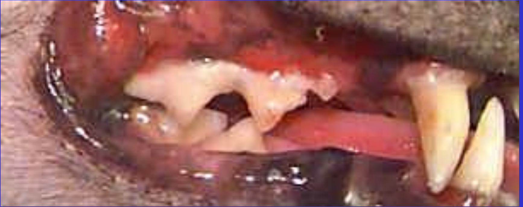
Dental plaklara karşı allerji