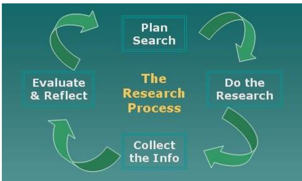
Fig. 1 The inspiration for the Research process model image above was the reflective model from: Edwards S. Bruce C. Reflective Internet Searching, an Action Research Model." In:

The research process should be understood as one of ongoing planning, searching, discovery, reflection, synthesis, revision, and learning, as shown in the figure 1 below: