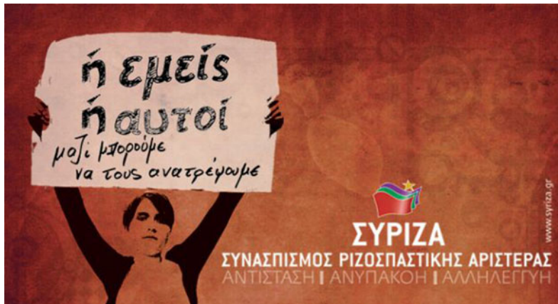
Figure 3. SYRIZA poster for the May 2012 elections.

ongoing ‘war of positions,’ a broader confrontation is staged, where the enemy is neoliberalism and its advocates (international financial institutions like the IMF and the current leadership of the EU). It is in the context of this second level that one should also assess the recent visit of Tsipras to left-wing Latin American governments. For Tsipras and SYRIZA ‘[today’s] Europe is on edge. Two worlds collide. On one side stand the productive forces of democracy, the people fighting to create a society of justice, equality and freedom. On the other side, a neoliberal biopolitical project unfolds.’ 51 There are various operations in SYRIZA’s discourse through which those two levels are linked. The most telling one was the pun often used by Tsipras about ‘troika exoterikou —troika esoterikou ’ (external troika—internal troika) 52 where the three-party coalition government between ND, PASOK and DIMAR was effectively equated with the country’s emergency lenders, the EC, the ECB and the IMF.