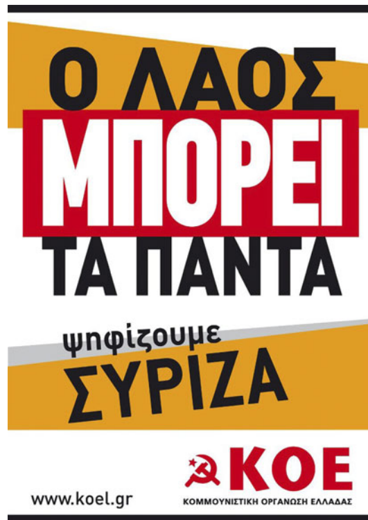
Figure 1. KOE poster for the June 2012 elections.

SYRIZA's main slogan for the campaign of the May 2012 elections gives a first revealing answer: 'They decided without us, we're moving on without them' (see Figure 2). This slogan, along with other similar ones, aimed to capture popular sentiments of frustration and anger against the harsh austerity measures; at the same time, it purported to point to an alternative path, building on popular hope for something better, something 'new,' for an alternative. It functioned as a discursive tool to establish 'chains of equivalence' among heterogeneous frustrated subjects, identities, demands and interests by establishing and/or highlighting their opposition to a common 'other': the 'enemy of the people,' that is the 'pro-austerity forces,' the 'memorandum,' the 'troika' and so on; in this discourse, all these forces, also organized through an equavalential logic, were presented as distinct but interrelated moments of the 'establishment.' SYRIZA's discourse thus divided the social space into two opposing camps: 'them' (the 'establishment,' the 'elite') and 'us' ('the people'), power and the underdog, the elite and the non-privileged, those 'up' and the others 'down.'