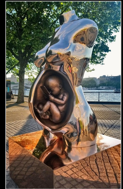
Italian artist Federico Clapis Crypto Connection at the Observation Point on Southbank London, UK