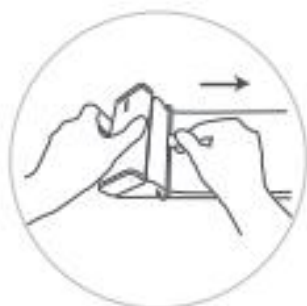
1. Unroll the cuff and pull the tab