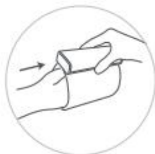
2. Insert your arm through the cuff loop