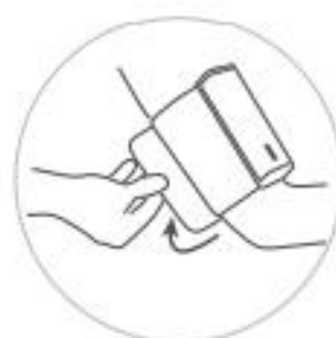
3. Close the cuff

1. Ideally, remove close-fitting garments from upper arm.