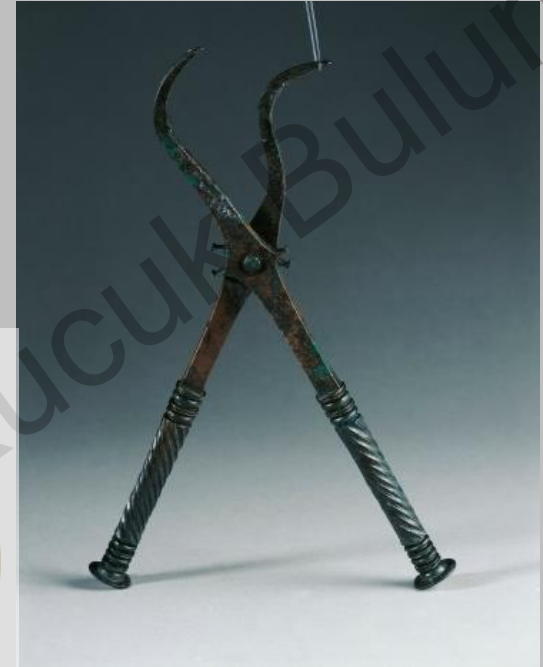
Surgical and cosmetic instruments: Diocles' scraper at top right, Invented by School of Medicine of Ephesus, Artifacts uncovered in Ephesus, Turkey, Roman Civilization, 2nd century