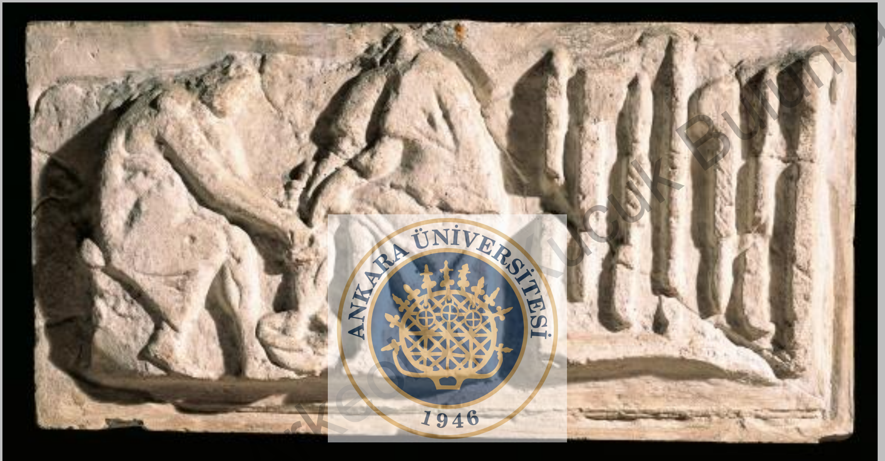
Roman civilization, terracotta funeral stone depicting act of blood-letting, surgical instruments, from cemetery on Isola Sacra, Ostia, Italy. Italy, Rome, Museo Della Civiltà Romana, Museum of Ancient Rome.