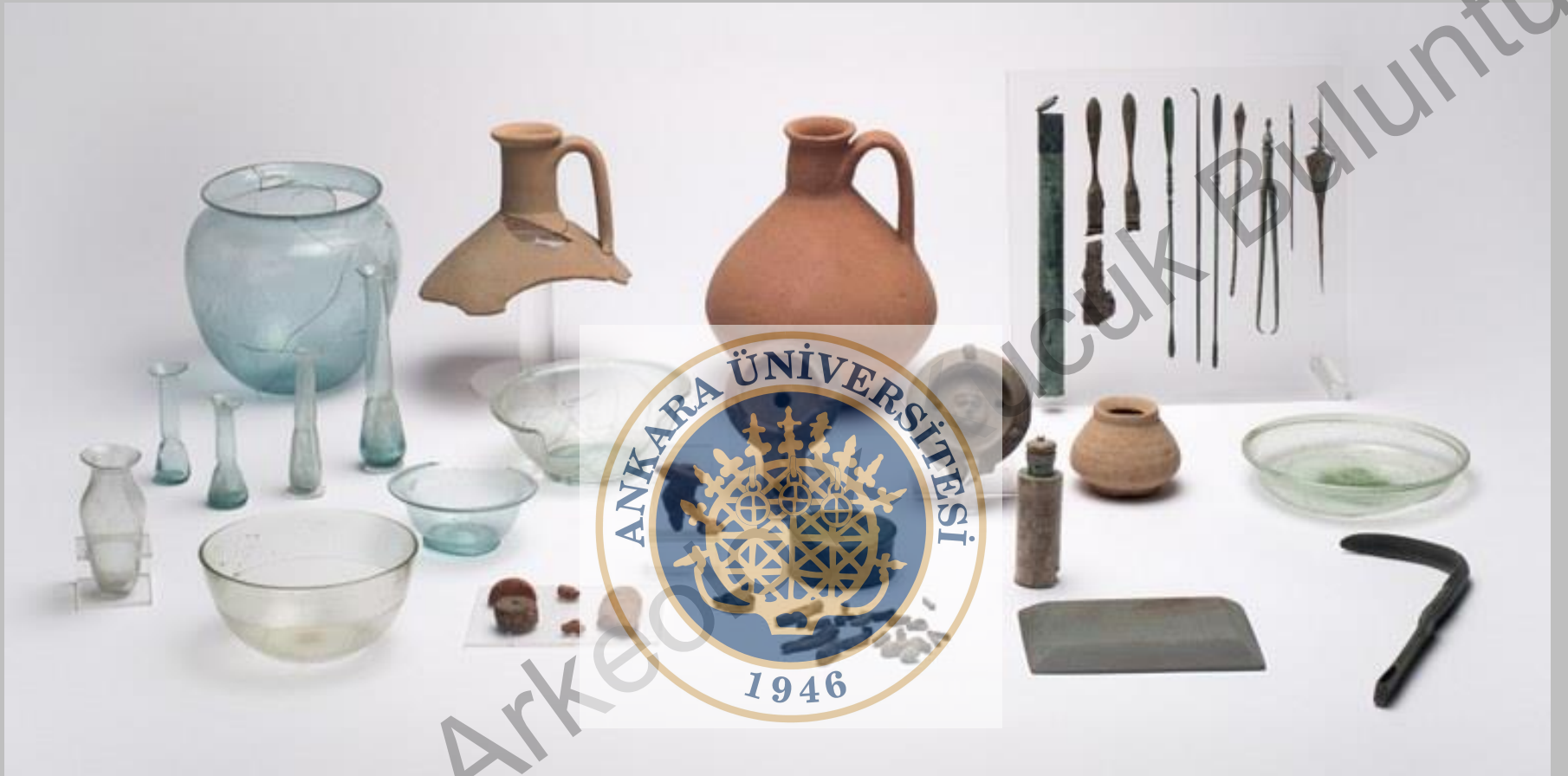
Doktora ait mezar buluntuları